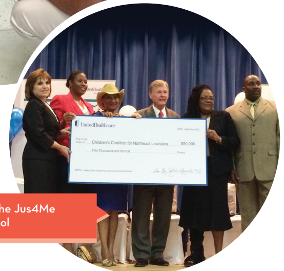
United Healthcare launches the Jus4Me program at Carroll High School