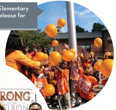
Students at Madison James Foster Elementary in Monroe participate in a balloon release for the 2015 Bully Awareness Day