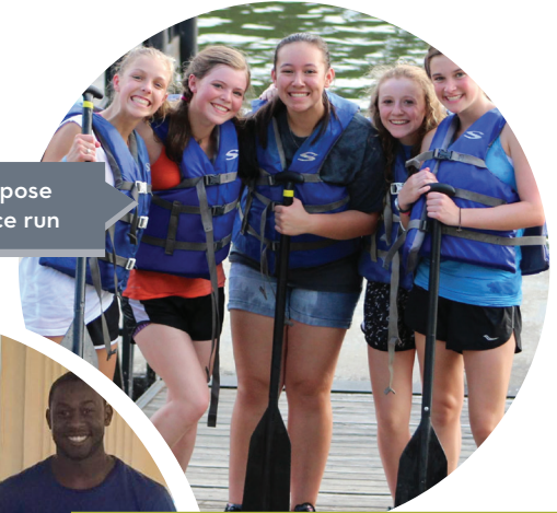
Members of team "Young Guns" pose before their Dragon Boat practice run