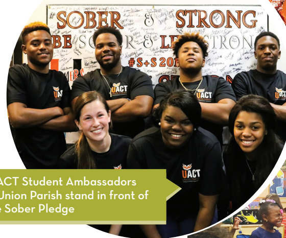
U-ACT Student Ambassadors in Union Parish stand in front of the Sober Pledge