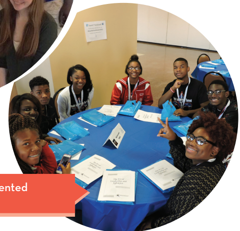
Richwood High School is represented at the Ouachita Youth Summit

“The kids loved the Youth Summit; they learned a lot and felt it changed their outlook on the topics discussed. They realized the importance of leadership, and it has changed school culture due to the youth leaders leading by example.”