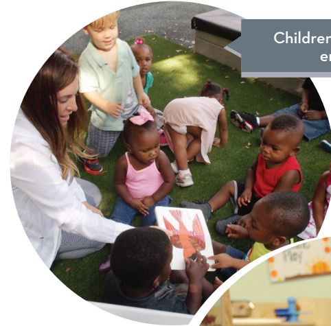
Children at EHS (ULM site) engage in story time