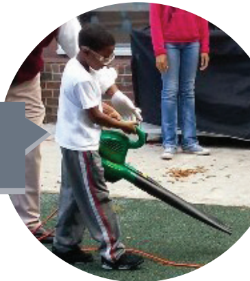
Cover photo: Taken at Claiborne Christian Preschool, West Monroe, LA