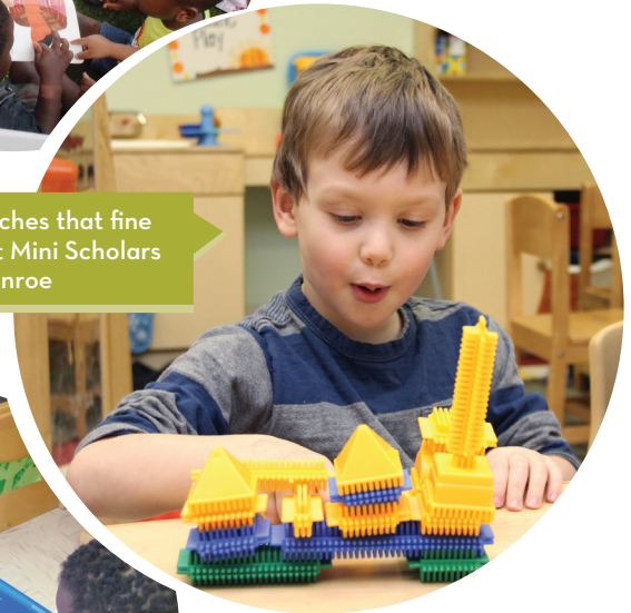
Child Care Connections teaches that fine motor skills are important at Mini Scholars Child Care Center, West Monroe