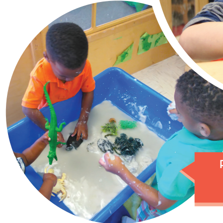
Preschool Expansion classrooms at Little Flower Academy in Monroe promote sensory play

““ The children in the PK Expansion classrooms did well with the small child care setting. It allowed them to be children a while longer. ””